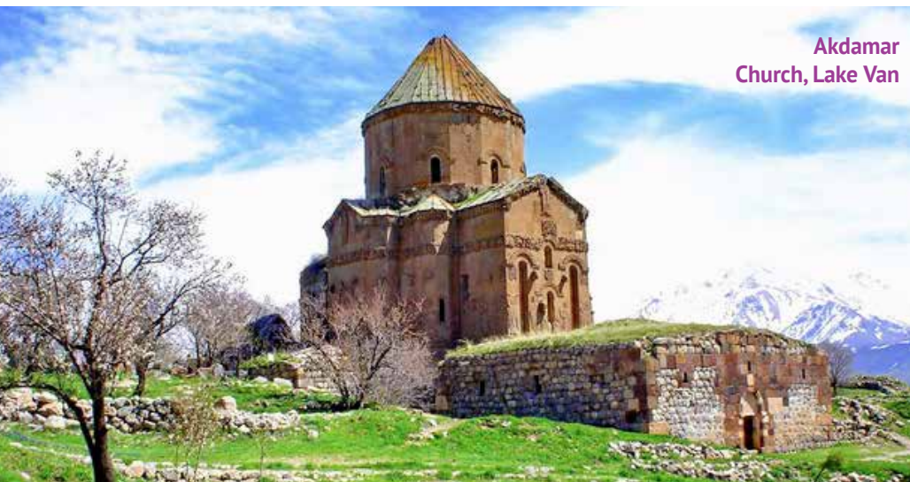
Akdamar Church, Lake Van